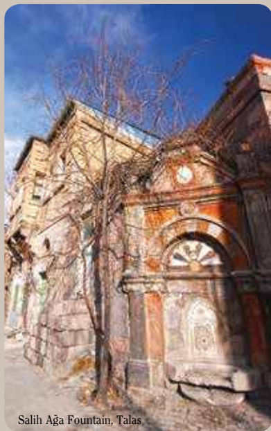
Salih Ağa Fountain, Talas