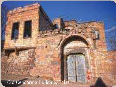
Old Gendarme Building, Talas

Both a holiday resort famous for its vineyards and gardens and a historical settlement hosting different civilizations for centuries, Talas is only 7 kilometers away from the city center. You must definitely explore the 5-kilometer “Talas City Tour” not to miss a series of details within the district borders.