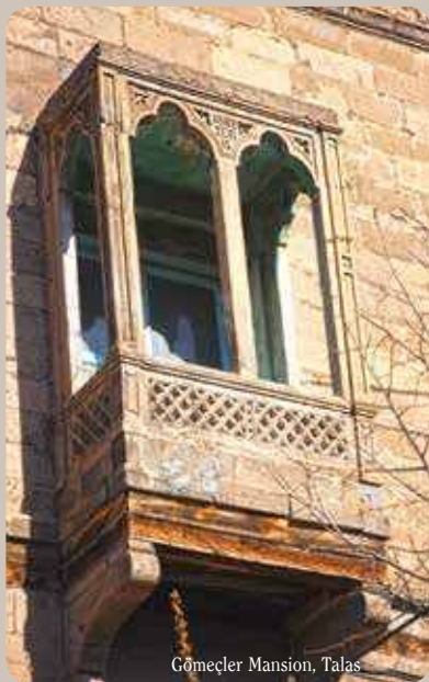
Gömeçler Mansion, Talas