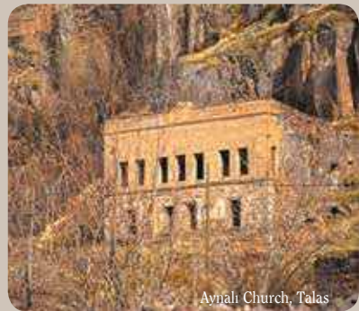
Aynalı Church, Talas