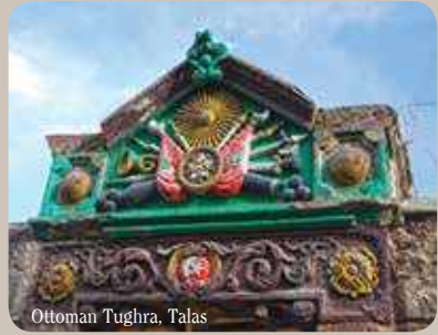
Ottoman Tughra, Talas

Your Talas tour starts at the northern end of Ali Saip Paşa Street. The first historical location is the building dating back to the 19th century and called Jandarma Mansion . After visiting Kiçiköy Aşağı Mosque right next to it, you enter Ali Saip Paşa