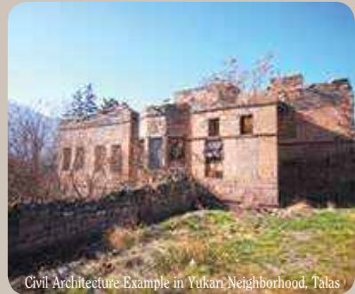
Civil Architecture Example in Yukarı Neighborhood, Talas