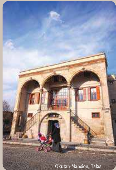
Okutan Mansion, Talas

As you ascend on Karaman Bayırı, the Aşağı (Lower) Talas part of the settlement will come into view with all its details. The first historical location of Yukarı Neighborhood, which you will reach at the end of the slope, is Kuyumcular Bazaar. Then, take the main road over Düzyol Street. You will see the public housing of the Old American Hospital and American College right across you. Turn left at this point and enter Kayabaşı Street. Alaybey and Feyzioğlu Mansions along with Devir Manor, which watch the entire Talas settlement from a high observation terrace, are among the most special locations of Yukarı Neighborhood.