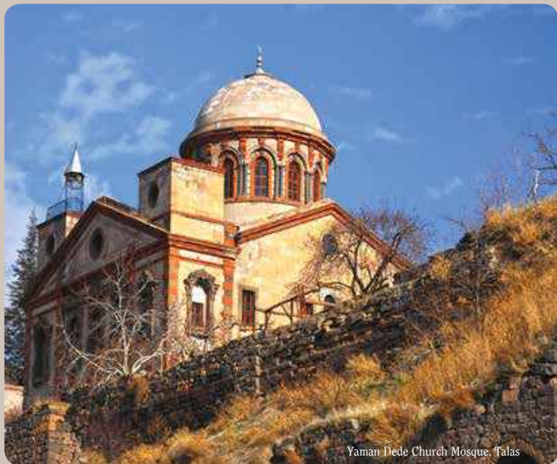
Yaman Dede Church Mosque, Talas