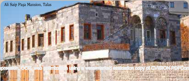
Ali Saip Paşa Mansion, Talas

The historical street opens to Gölbaşı Square . At this point, you can visit Ali Saip Paşa , Aksoylar and Samur Mansions as well as other historical structures. Now take Erhan Street across and proceed. Again, by walking in company with the historical buildings that reflect the old city texture, you will reach Harman Square. Among the most important works that you can see in